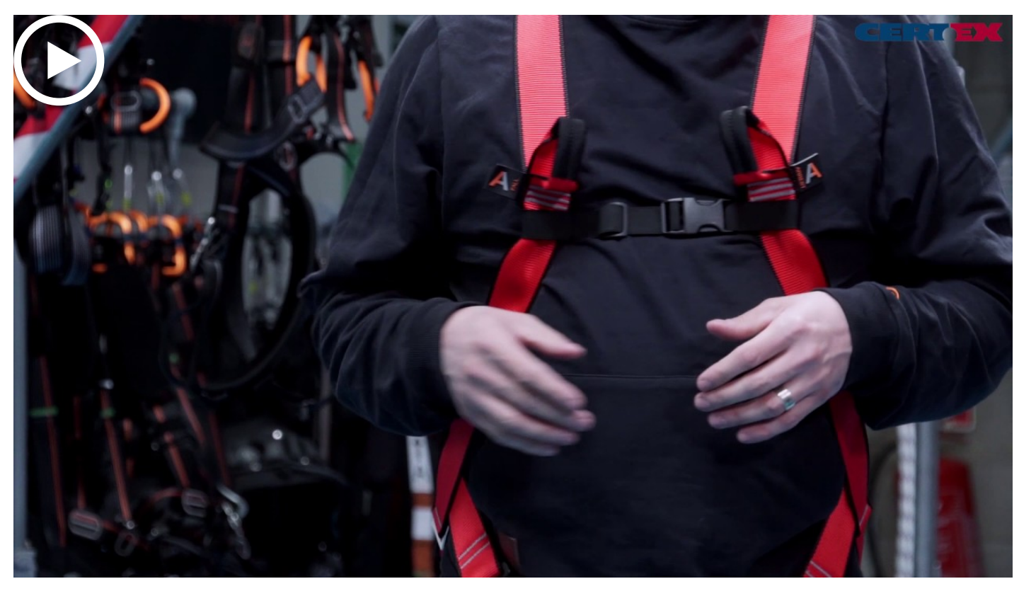
We also have a set of videos on safe working practises when lifting heavy items commercially.